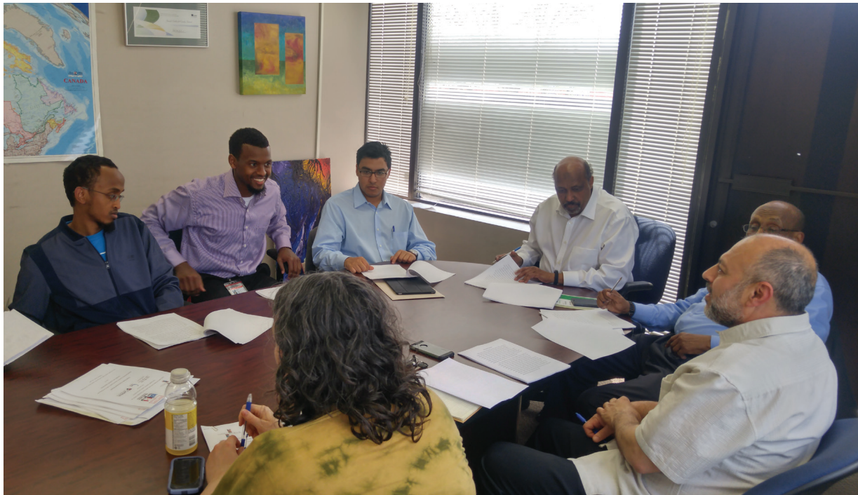
The team at work.